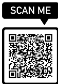
Figure 7 OTAW1 Workshop QR Code

A QR code leading to a full Conference Booklet was also publicised via email, on the workshop website and on social media.