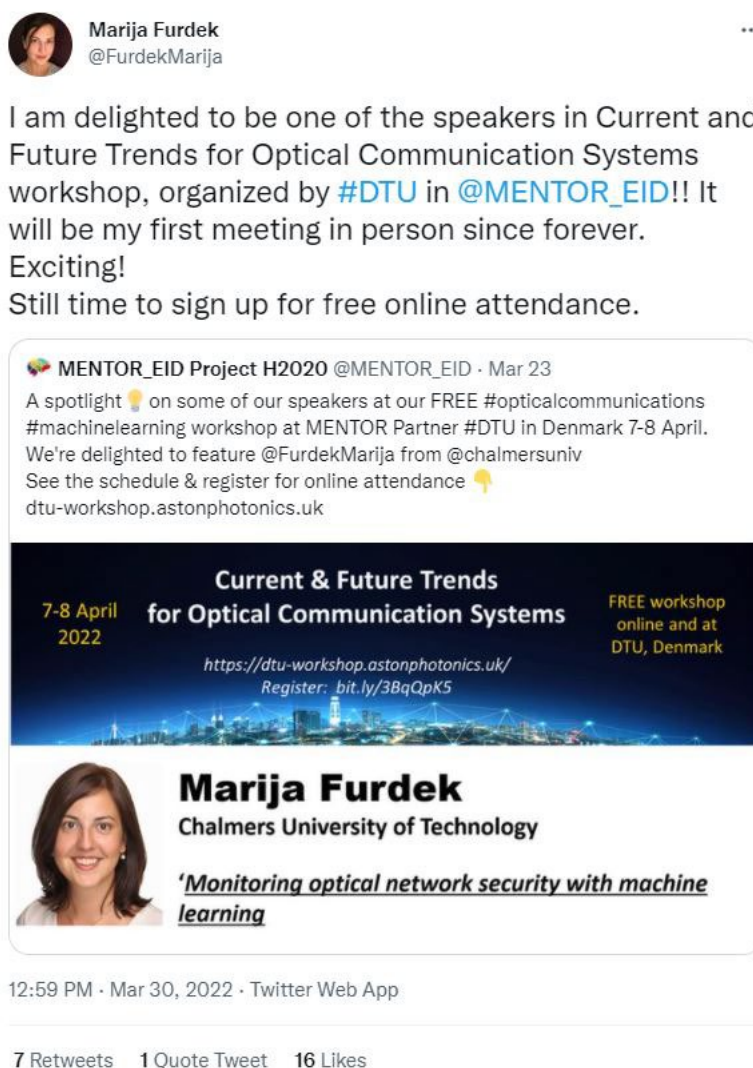
Figure 8 The top tweet in March in the run up to the workshop

It was also the Tweet that gained the highest number of impressions, 1,215 (impressions are the number of times users see a Tweet on Twitter). The average number of impressions per workshop tweet for MENTOR was 200, however another peak was during the workshop itself when impressions reached 400).