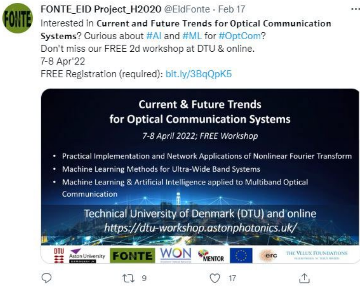
Figure 5 OTAW1 on EID FONTE's Twitter stream

MENTOR (@MENTOR-EID, 168 followers) advertised the project on Twitter from early February onwards, as did ITN projects EID Fonte (@EIDFonte, 340 followers) and ETN Won (@ETNWon, 453 followers).